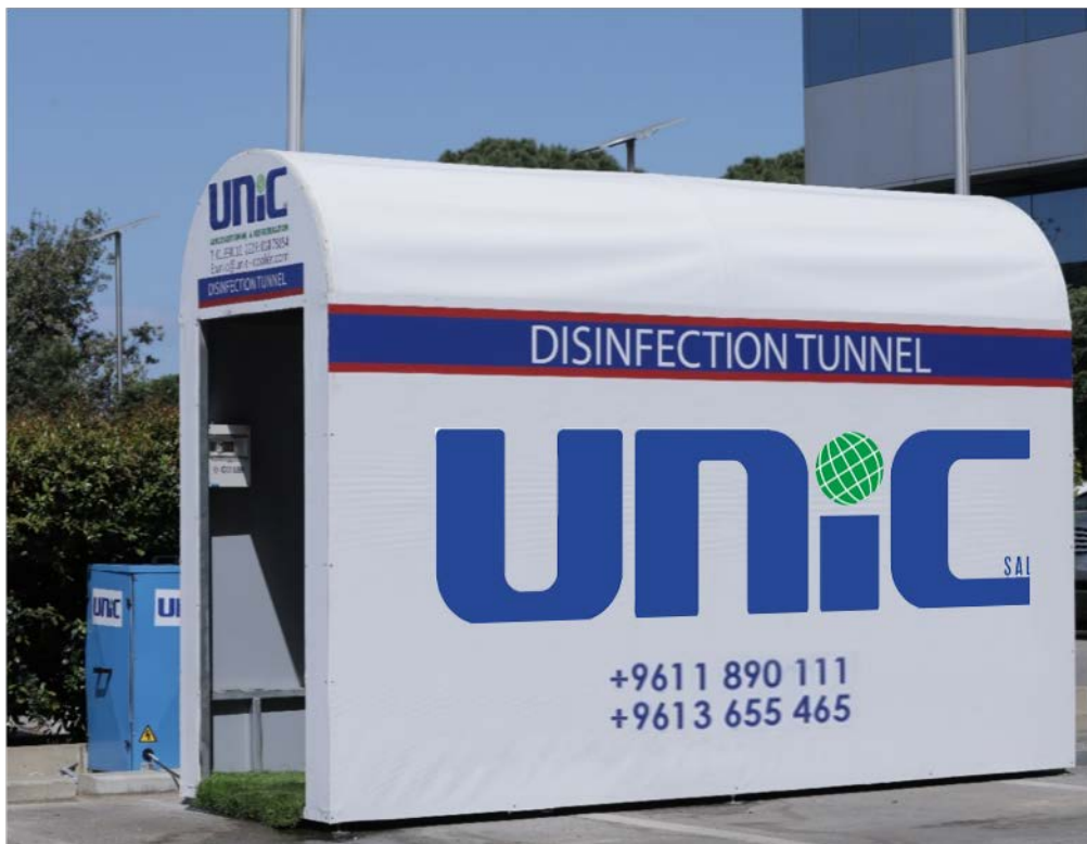
UNIC sal – Old Roumieh Road – Nahr El Mot Industrial Area – Beirut – Lebanon

The emergency outbreak of coronavirus (nCoV-2019) has become a global pandemic. This emerging virus is causing health concern and putting patients at risk of developing severe respiratory complications. Human-to-human transmissions have been facilitating its spread primarily via breathable droplets and/or contaminated hands from surfaces that droplets have landed on.