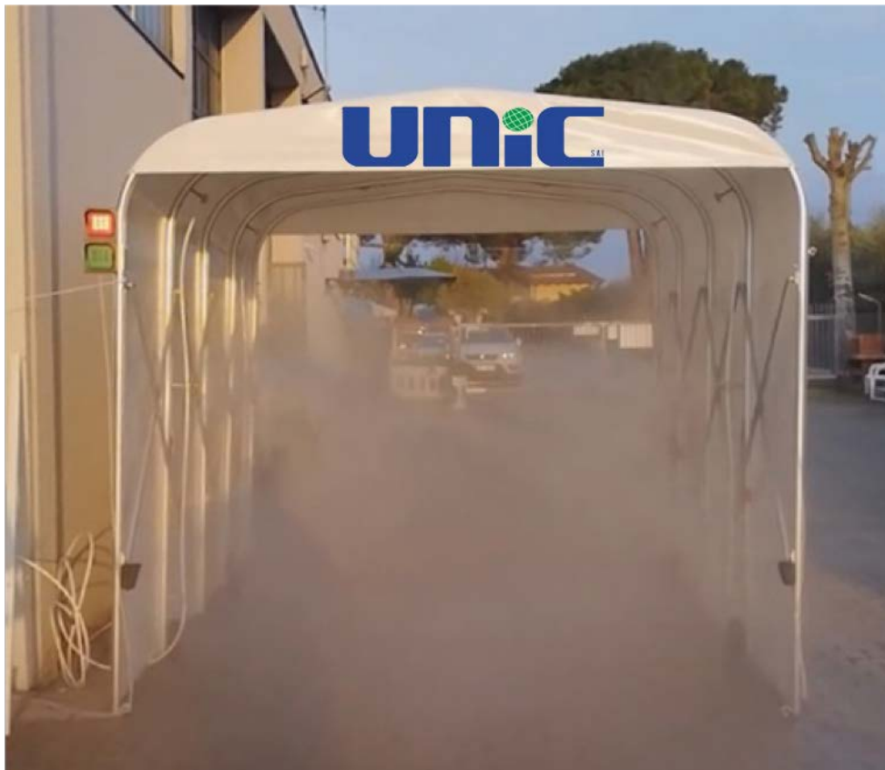
Tunnels for Ambulances Disinfection undergo testing at the Factory before delivery

UNIC sal is also assembling larger Tunnels for Cars and Ambulances Disinfection.